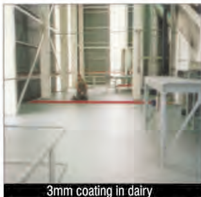
3mm coating in dairy

If you would like more technical information about MONOTEK® flooring systems or a demonstration of just how fast setting our flooring is, please contact us for an equally speedy response.