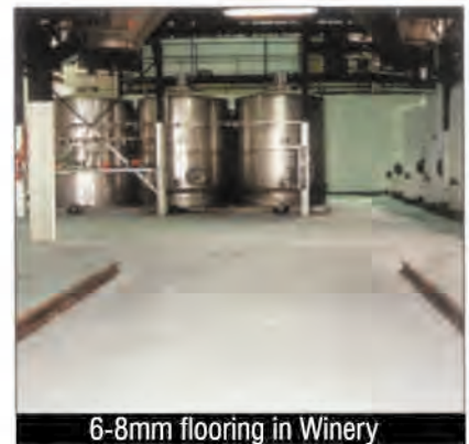
6-8mm flooring in Winery

MONOTEK® the smart choice in applied flooring systems