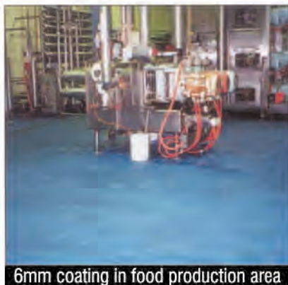
6mm coating in food production area